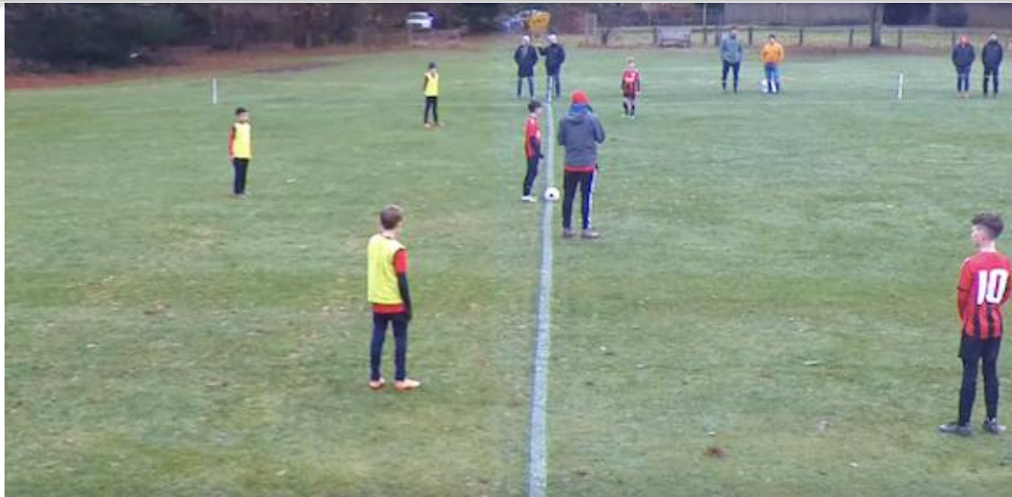
Nutley U11s v Oxted 16-Dec-23