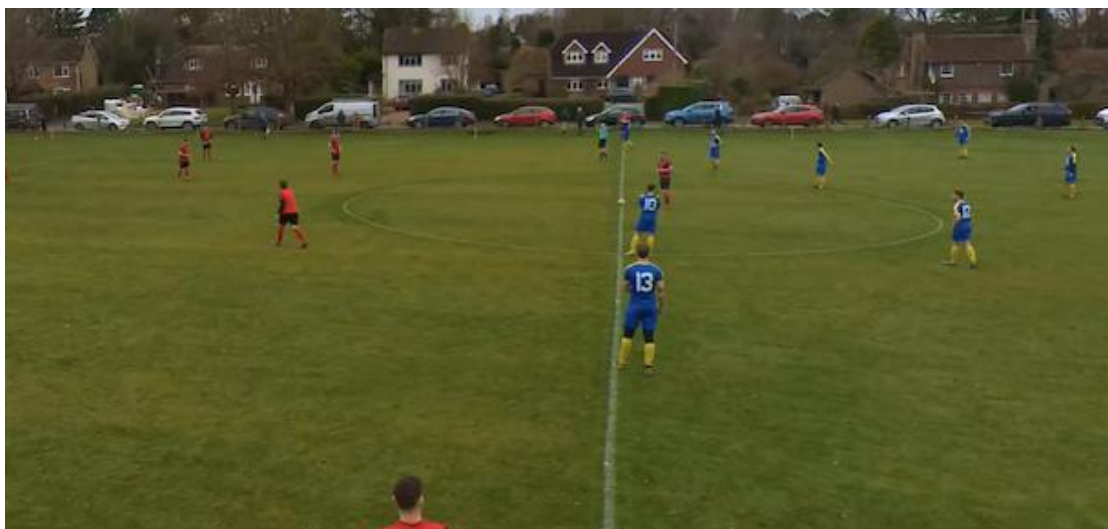
Nutley men's v Eastbourne 16-Dec-23