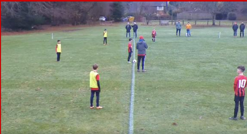
Nutley U11s v Oxted 16-Dec-23