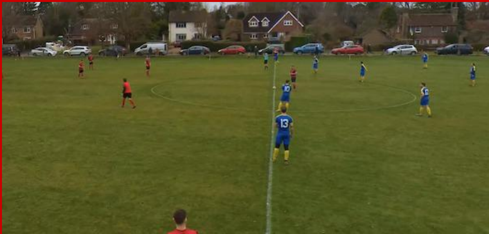
Nutley men's v Eastbourne 16-Dec-23