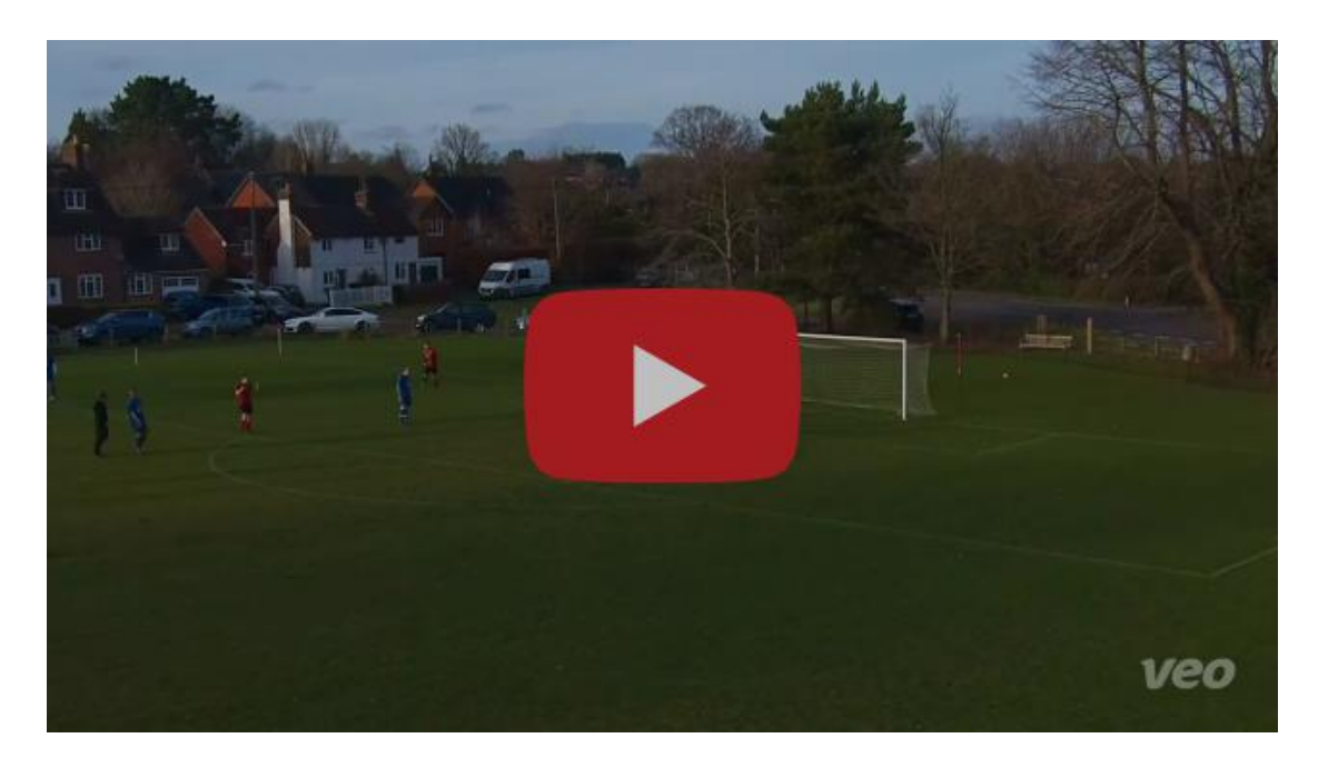
Nutley v Polegate Town 27-Jan-24