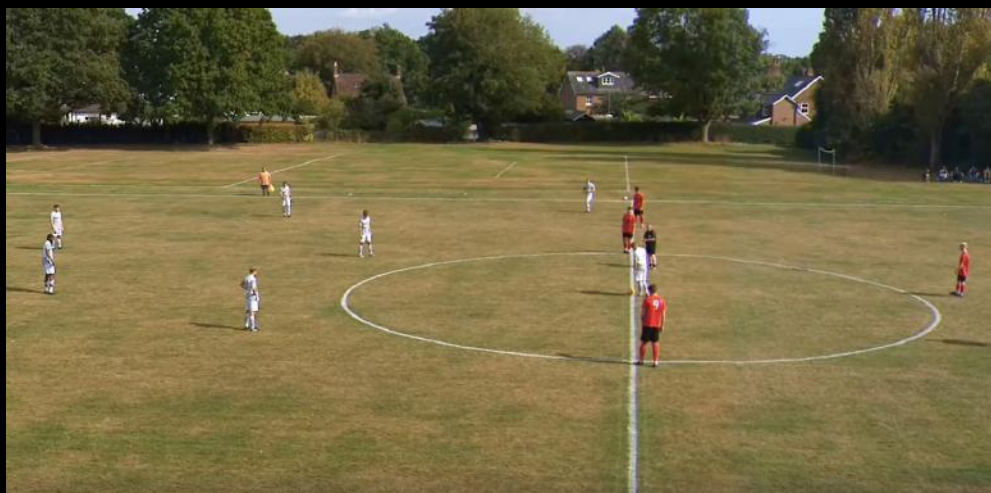
Ifield v Nutley 16-Sep-23

The squads are all a healthy size and spirits are high. We hope they all have a lot of fun. You can watch some recent matches recorded on the VEO on the links below.