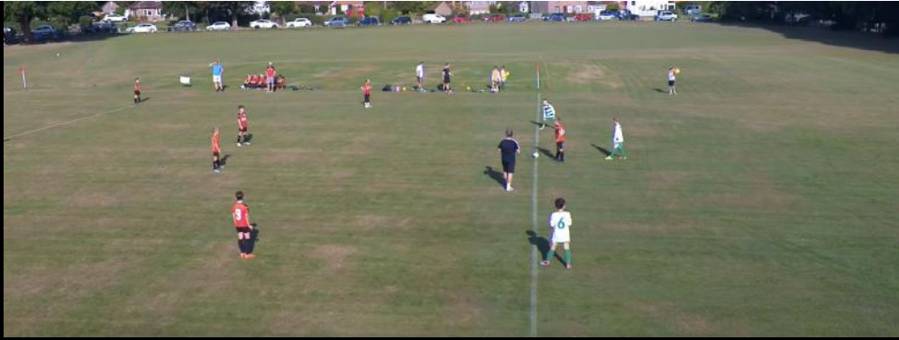
Nutley v Rotherfield 16-Sep-23